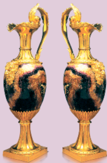
Pair of Ormolu & Blue John ewers, Boulton & Fothergill, c1772

The house is open Easter to the end of October, Tuesday to Sunday 12 noon – 4pm, closed Mondays except Bank Holidays. Admission free. For more information visit www.bmag.org.uk or telephone 0121 554 9122.