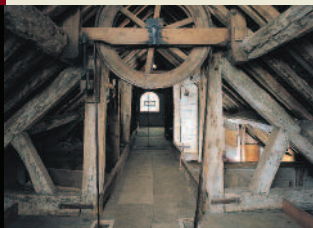
The attic floor or garner