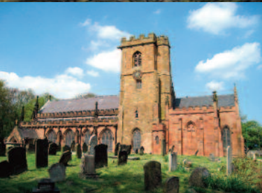
St Mary's Church today