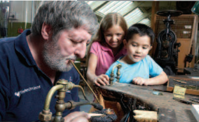
Jewellery demonstration on the factory floor

Located in the original factory of the jewellery manufacturing firm of Smith & Pepper, the museum tells the story of jewellery and metal-working in Birmingham and features a number of Boulton pieces in its displays.