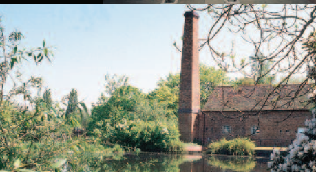
View of the mill from the millpond. The chimney is a mid 19th century addition

Although better known for its association with the young JRR Tolkien, Sarehole Mill also has a link with Matthew Boulton who leased it between 1756 and 1761.