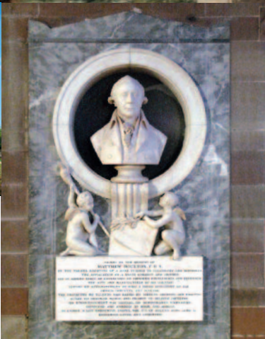
Boulton memorial by John Flaxman (1755-1826)

Boulton, Watt and Murdock are all buried here. Boulton's memorial was sculpted by John Flaxman, one of the most gifted sculptors of the age.