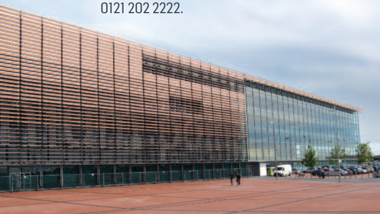
Thinktank at Millennium Point

Open daily except 24, 25 and 26 December. Admission charged. For more information visit www.thinktank.ac or telephone 0121 202 2222.